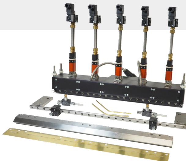
Equity C™ NC with non-contact kit